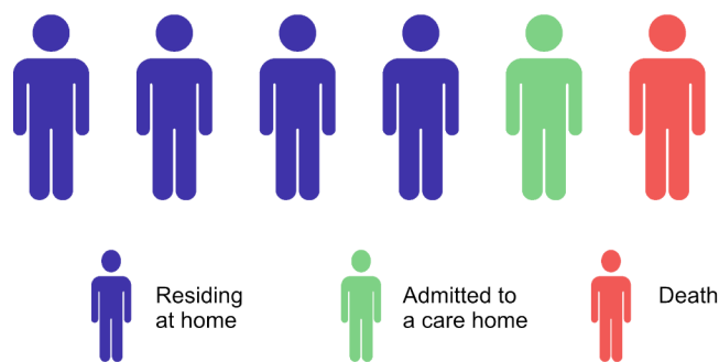
Figure 2 Approximate outcome at 6 months after a proximal hip fracture in older adults previously living at home prior to fracture

Data from the Maltese national statistics office from 2018 was used to establish the population size. The estimated incidence of proximal femoral fractures in Malta in persons aged 70 years and over was found to be 7.29 per 1000 persons per year in females and 4.66 per 1000 persons per year in males. In the age group 70 -79 years, the incidence was found to be 3.09 per 1000 persons per year. In females this was 3.43 per 1000 persons per year, and in males this was 2.71 per 1000 persons per year. The incidence rate rose dramatically with age, with a rate of 10.47 per 1000 persons per year in those aged 80 – 89 years, and 24.23 per 1000 persons per year in those aged 90 years and over, shown in Table 2 , Supplementary File 1 , and Supplementary File 2 .