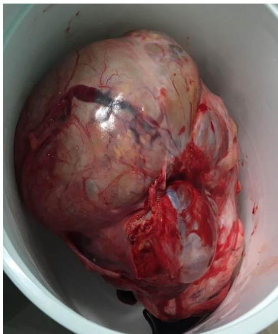
Figure 1: Image showing the left smooth adnexal mass measuring 20cm by 13.5cm by 12.5cm. The fallopian tube is also visible, measuring 9cm by 3cm.

The histological result confirmed a malignant Brenner tumour limited to the ovary, with angiolymphatic invasion (figure 2), pT1c3NxM1b, FIGO IVB.