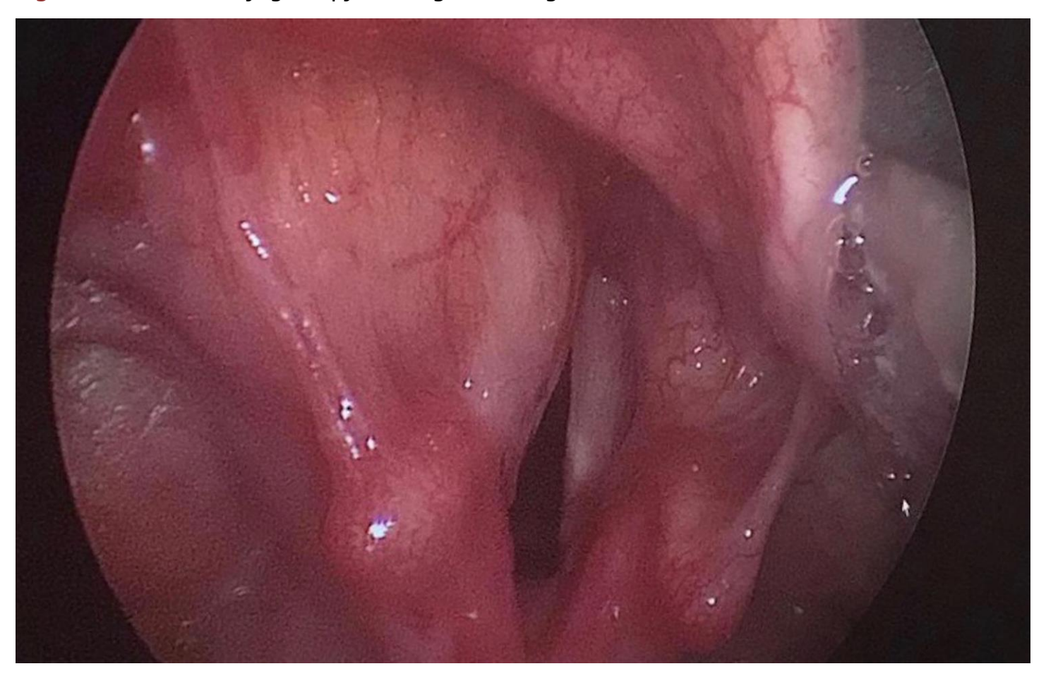
Figure 3 Direct laryngoscopy showing thickening of the left false vocal cord.

excision of the mass using carbon dioxide laser technology. The patient had an initial good response to treatment, however later complained about the development of a gravelly quality to her voice. Endoscopy showed a 0.5cm cyst overlying the left false vocal cord and was treated with a further two laser procedures. As a consequence to laser therapy, a granuloma was seen on follow up but this healed spontaneously. The symptoms resolved following the third laser procedure and the patient is being followed up once yearly.